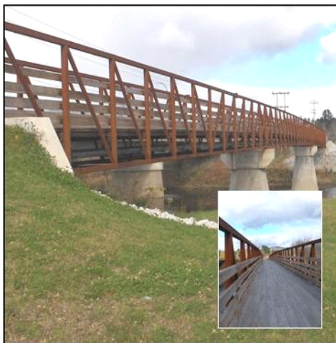
Two views of the new recreational bridge.