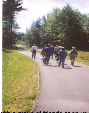
Walk with a group of friends or on your own.