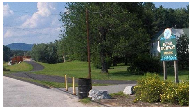
Route 2 & 26 entrance & view of recreational bridge.