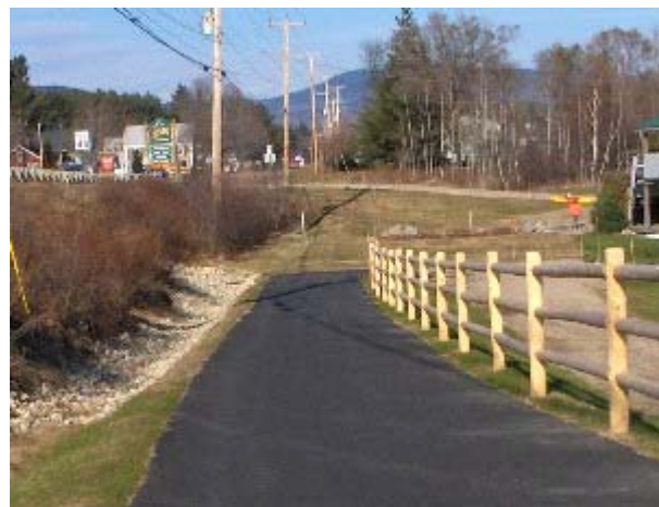
The Mayville side of the recreational bridge.