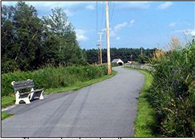
There are benches along the way to relax and enjoy the fresh air!