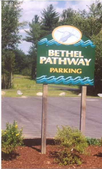
Paved parking areas.

The Bethel Recreational Path is a nearly one-mile multi-use paved trail, commencing at Davis Park.