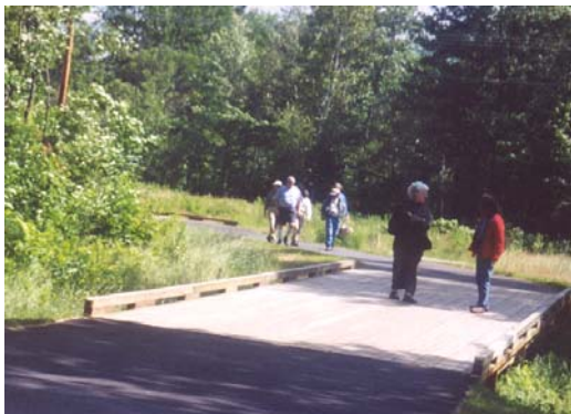
Walking over one of the bridges along the way.

Walk Jog Skateboard Cycle Rollerblade Snowmobile XC Ski Snowshoe