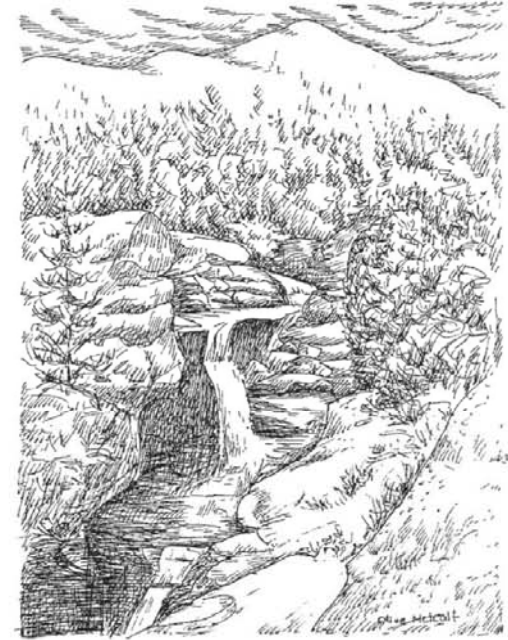
Screw Auger Falls and Old Speck Mountain Grafton Notch State Park Grafton Township, Maine