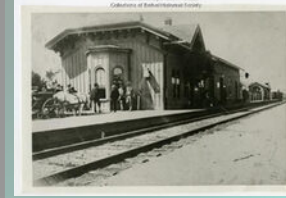
Grand Trunk Railway station, Bethel, ca. 1880

Thank you to the Historical Society for the memories