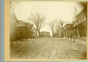
Main Street, Bethel Hill, 1896