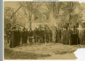
Civil War memorial groundbreaking, Bethel, 1908